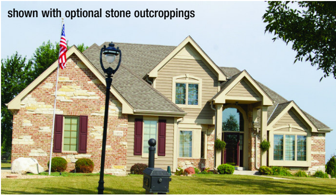
shown with optional stone outcroppings

This classy home features sky lights and quarter-circle windows in the 2-story greatroom. The open kitchen and dinette are serviced by the adjacent pantry and utility area. A first floor master suite and formal dining room round out the main floor while another 2 bedrooms and a full bath are found on the second floor.