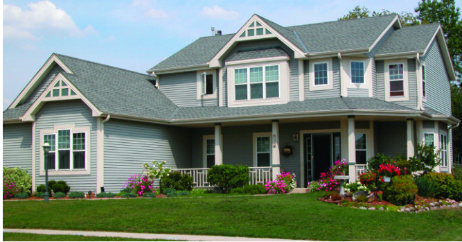
Shown here with optional boxed out bedroom window

The Ivycrest III is an efficient 2-story home with an open concept that includes a large greatroom, kitchen and dinette. A formal dining room is situated off the kitchen and may be used as a den. A beautiful covered porch is a highlight of this design.