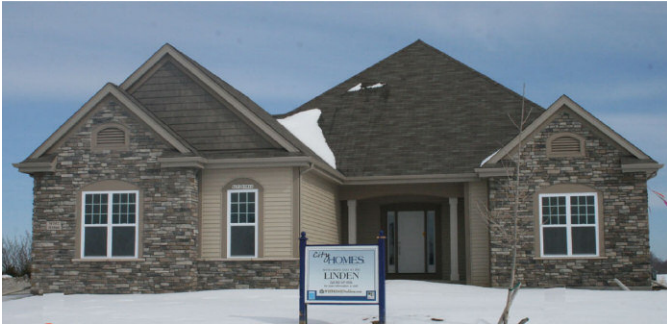
Shown with optional stone

This lovely ranch design has a great open concept that is practical yet stylish. The master suite is designed to be private and apart from the rest of the household, while you will find 2 other bedrooms conveniently off the front hall.