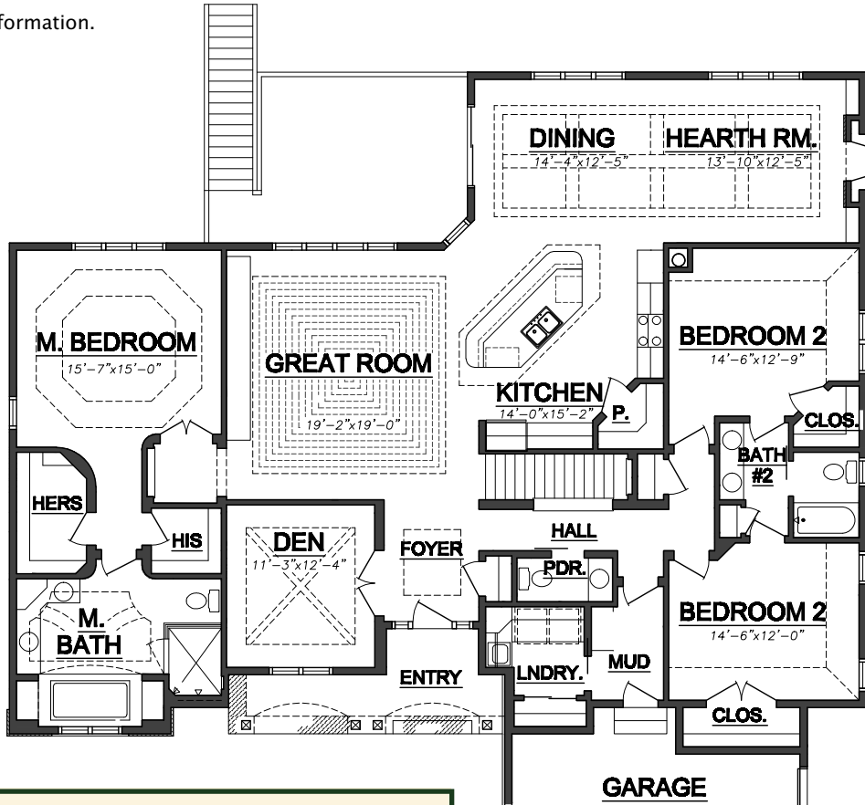
First Floor - 2,698 square feet (shown with optional deck)

Westridge's seasoned sales staff will help design, customize and build your home. Customization is FREE and an essential part of designing everything you dream your new home should be. See a sales associate Saturdays and Sundays from 1-4 in the models for more information.